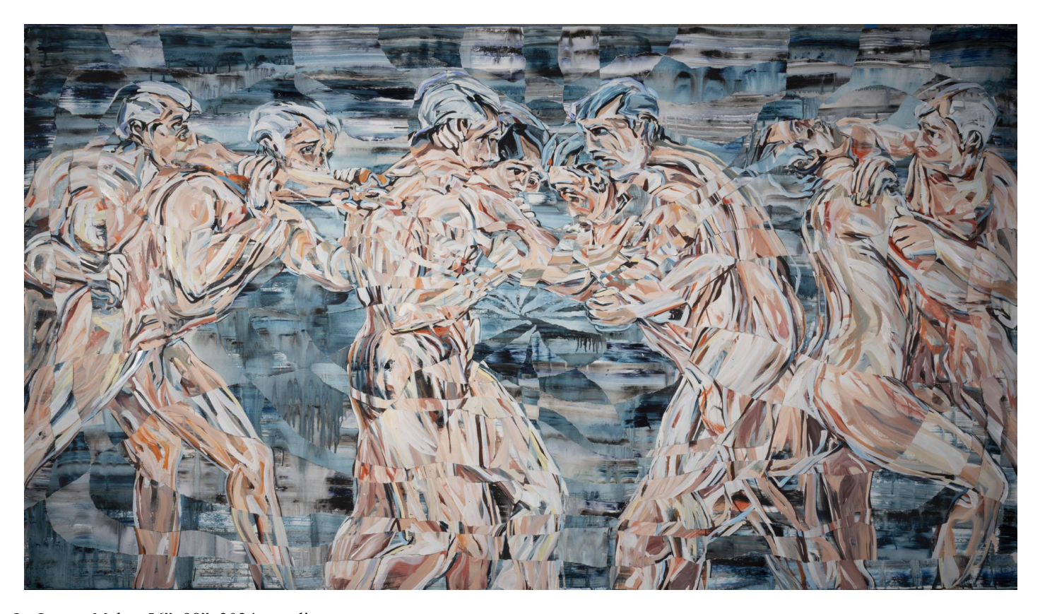
La Lutte - Melee, 56"x98", 2024, acrylic on woven paper.