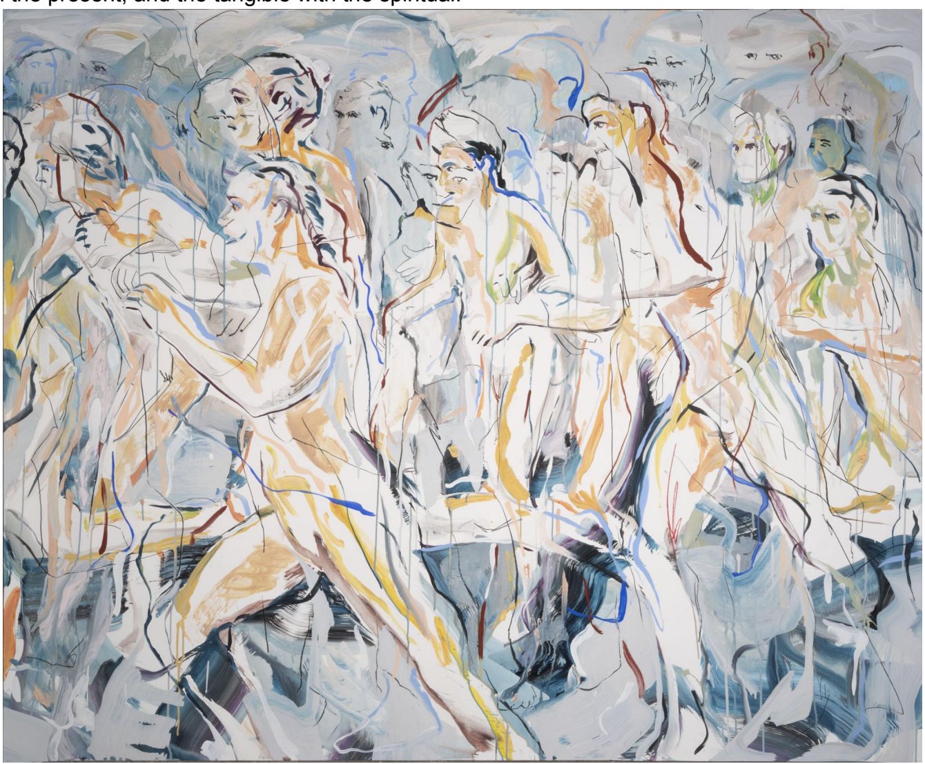
La Fuite - Chercher le Soleil, 55.5 x 67.5 ", 2017, acrylic & pastels on paper.