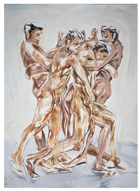
la Lutte, Repetitions and Solutions, Triptych, Repetition I & II, Solution I, each 67.5 x 56, 2024, Acrylic on paper.