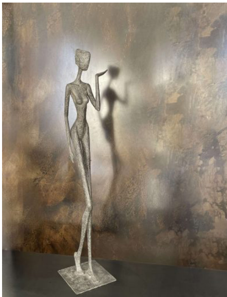
Sentiment, 2024 Bronze, 8 of 8 + 4AP 41 in. / 105cm